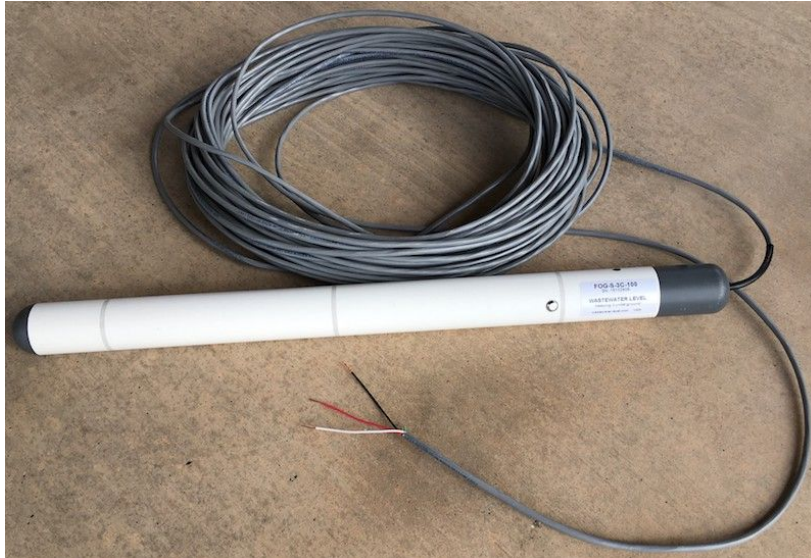
Photo of FOG-S-3C-100 - the 3-contact unit, no ground point, with 100ft (30m) cable:

The version with the ground point, FOG-S-3CG-100: